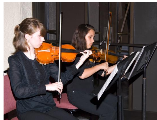
Members of the Mansfield Symphony Youth Orchestra