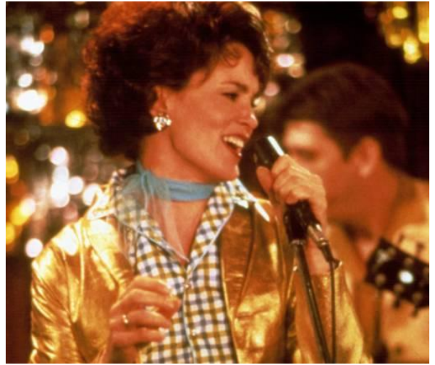
Jessica Lange as Patsy Cline

Sweet Dreams is a 1985 biographical film which tells the life story of Patsy Cline. The movie was written by Robert Getchell and directed by Karel Reisz. It stars Jessica Lange, Ed Harris, Ann Wedgeworth, David Clennon, James Staley, Gary Basaraba and John Goodman. The movie was nominated for Academy Award for Best Actress (Jessica Lange). For all the musical sequences, Lange lip-synced to the original Patsy Cline recordings. The soundtrack of the same name was released in September 1985.